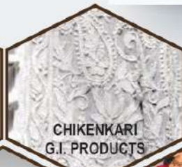
CHIKANKARI G.I. PRODUCTS