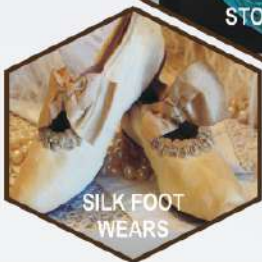
SILK FOOT WEARS